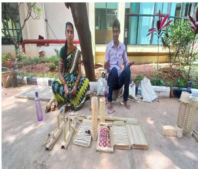
Artisans with their creation during the training programme at NID.