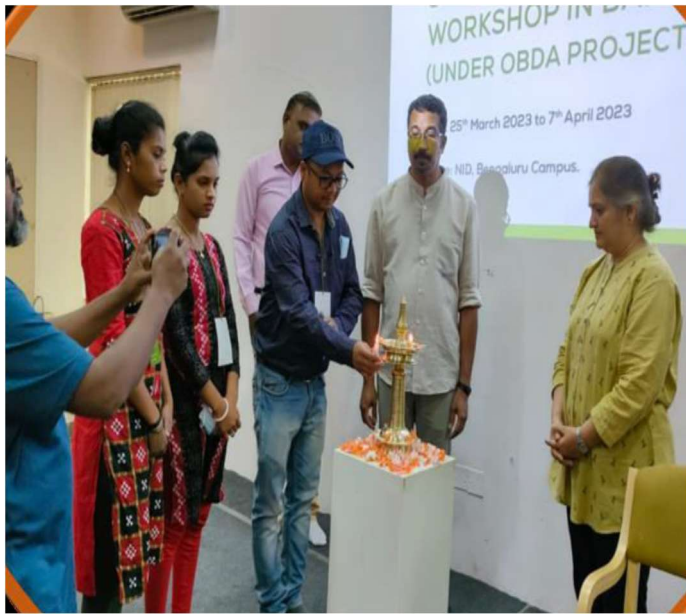
Inauguration of skill development workshop on 07.04.2023 at NID, Bengaluru.

Products made by artisans at NID either completely by hand or with the help of hand tools or even mechanical means.